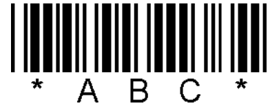
Figure 2 - A typical bar code (Code 39)

A bar code can best be described as an "optical Morse code". Series of black bars and white spaces of varying widths are printed on labels to uniquely identify items. The bar code labels are read with a scanner, which measures reflected light and interprets the code into numbers and letters that are passed on to a computer.