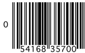
Figure 9 - UPC-A Symbology

The UPC bar code can be printed in two formats, a full 12 digit UPC-A form and a compressed 8 digit UPC-E form. UPC-A and UPC-E also allow two or five digit supplemental numbers. UPC-A and UPC-E codes require checksums.