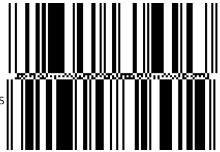
Figure 20 - RSS-14 Expanded Stacked Symbology

RSS Expanded Stacked has the same omni-directional scanning performance as standard RSS Expanded.