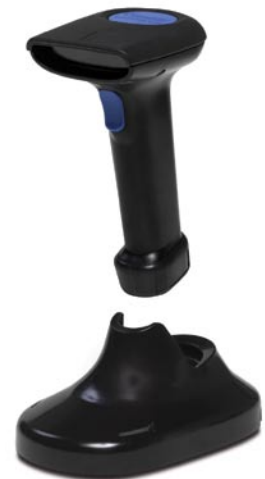
Figure 4 - QuickScan QS6500

The Datalogic QuickScan® and PowerScan® families of hand-held laser scanners, are input devices that use scanning technology for data collection. These input devices permit non-contact scanning of bar code labels on flat, curved and irregular surfaces up to distances of 60 feet and come in undecoded, decoded, and RF models. Decoded models can be connected to any supported PC or terminal as either a keyboard wedge or a serial device. Undecoded models must be used with decoders or with portable data terminals.