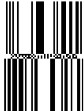
Figure 17 - RSS-14 Stacked Omni-directional Symbology

RSS-14 Stacked Omni-directional is a full-height two-row format. It has the same application as the full-height RSS-14 but is used where a narrower symbol is needed. The separator pattern between the two rows is designed to eliminate cross-row scanning errors.