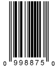
Figure 10 - UPC-E Symbology