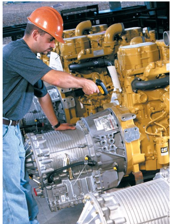
Figure 3 - Datalogic PowerScan RF in a Warehouse

These expanded systems have measurably increased productivity by linking production, warehousing, distribution, sales, and service to management information systems on a batch or real-time basis.