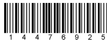
Figure 13 - MSI/Plessey Symbology

The MSI bar code is used most often in the grocery industry for shelf labels. This is a numeric-only code that stands up well to wear and tear. This code is not self checking, and so a checksum is required. It supports three types of checksums.