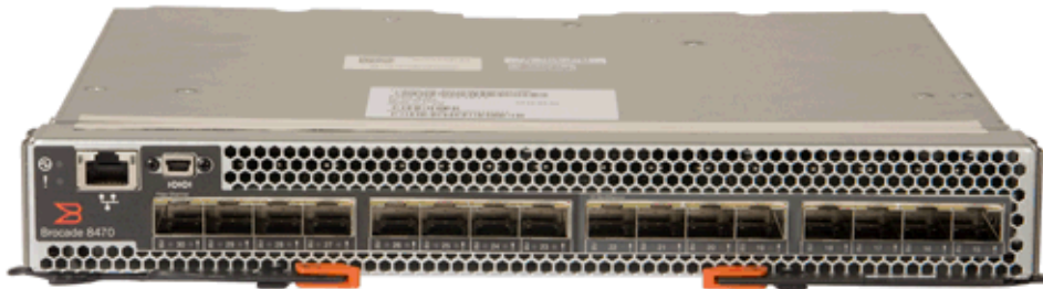
Figure 1. Brocade Converged 10GbE Switch Module for IBM BladeCenter